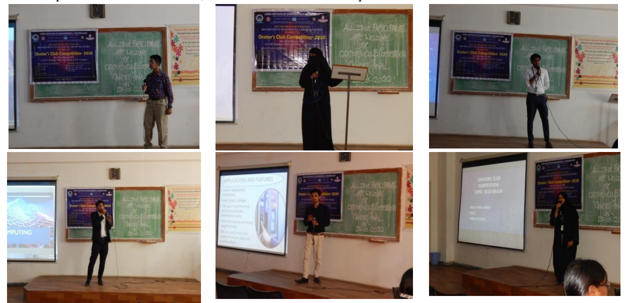
• The shortlisted participants for Semi-Final are:

The following are the highlights of Quarter Final Competition: The Entire English Department Faculties were present to judge the performances. The competition continued for the whole day as decision was taken that class work should not be disturbed, thus, the branches slots were assigned as CSE & IT in Morning session and ECE, EEE, CIVIL & MECH in Afternoon session. Due to sudden outburst of COVID-19 PANDEMIC, Semi-final and Final competition was cancelled. But, we declared the winners of quarter-final as the Best Orators of 2019-20.