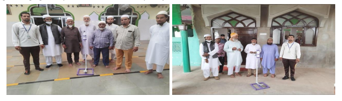
25. Distribution of Essential Commodities to poor people under Lockdown

Lords Institute of Engineering and Technology as part of National Service Scheme (NSS) organized a seminar on Awareness Programme on Arogya Setu App and Covid 19 at Attapur, Doodh Bowli Village on 22-04-2020. The 1<sup>st</sup> year NSS volunteers created awareness among the public of Attapur, Doodh Bowli about AROGYASETUAPP AND COVID-19. The seminar was to sensitize the participants on Covid issues, to help them be aware of virus, get informed about infected persons in contact in order to take quick action and distributed the hand sanitizer equipments prepared by Lords Students to nearby Masjids.