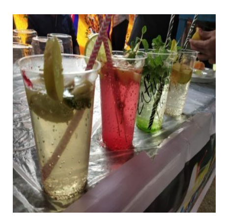
The Management is encouraging the students by savoring their dishes.