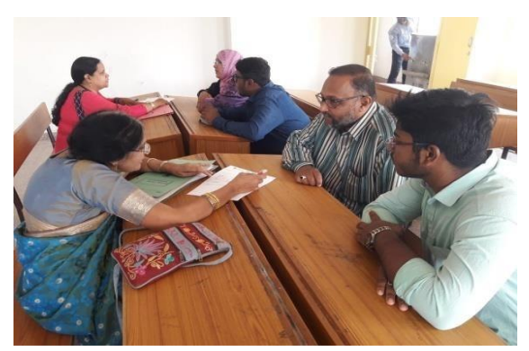
Class In charges of \mathbf{1}^{st} year interacting with the