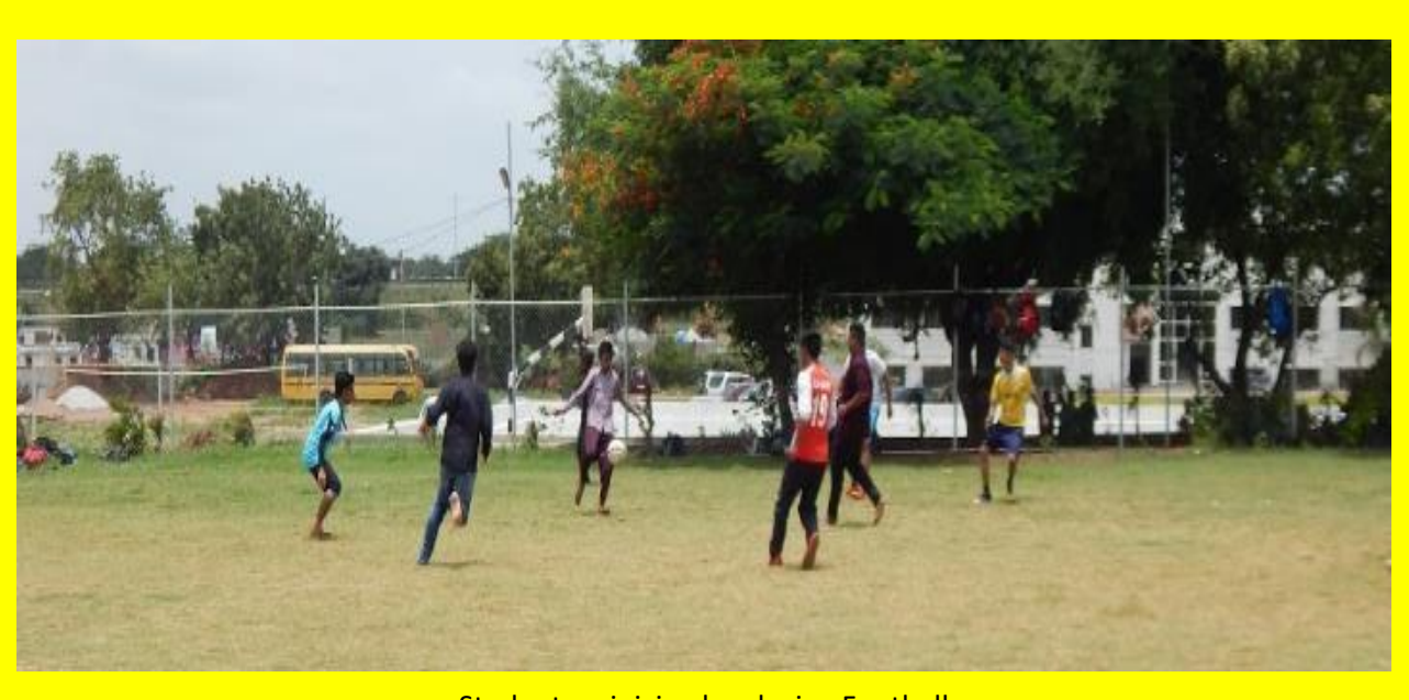
Students rejoicing by playing Football