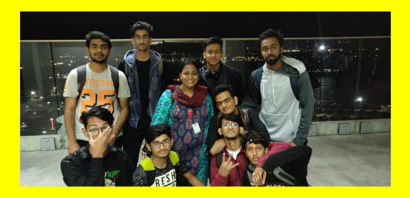
Full of Smiles and Enjoyment at Wonderla!