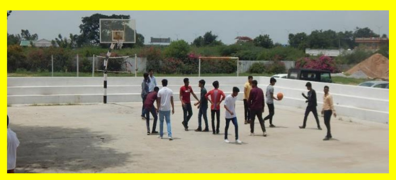
Breath - taking Basketball game by the students

Day-5: The Students were thrilled by the Team Building activities conducted in the seminar hall by the faculty members of English, Chemistry and Mathematics in both the sessions. The second session continued with the Essay writing and Just A Minute, i.e., JAM session. The students participated actively.