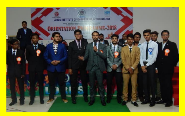
Seniors welcoming the Juniors Promising for Anti -Ragging