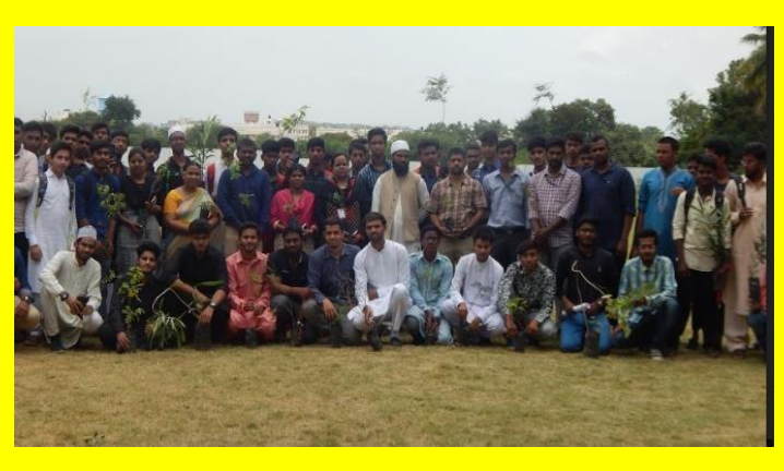
Students along with NSS team at playground