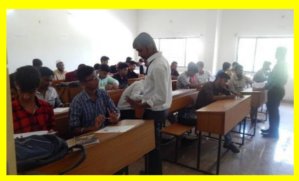
Students at the Engrossing Literary Competition

Day-5: The Students were thrilled by the Team Building activities conducted in the seminar hall by the faculty members of English, Chemistry and Mathematics in both the sessions. The second session continued with the Essay writing and Just A Minute, i.e., JAM session. The students participated actively.