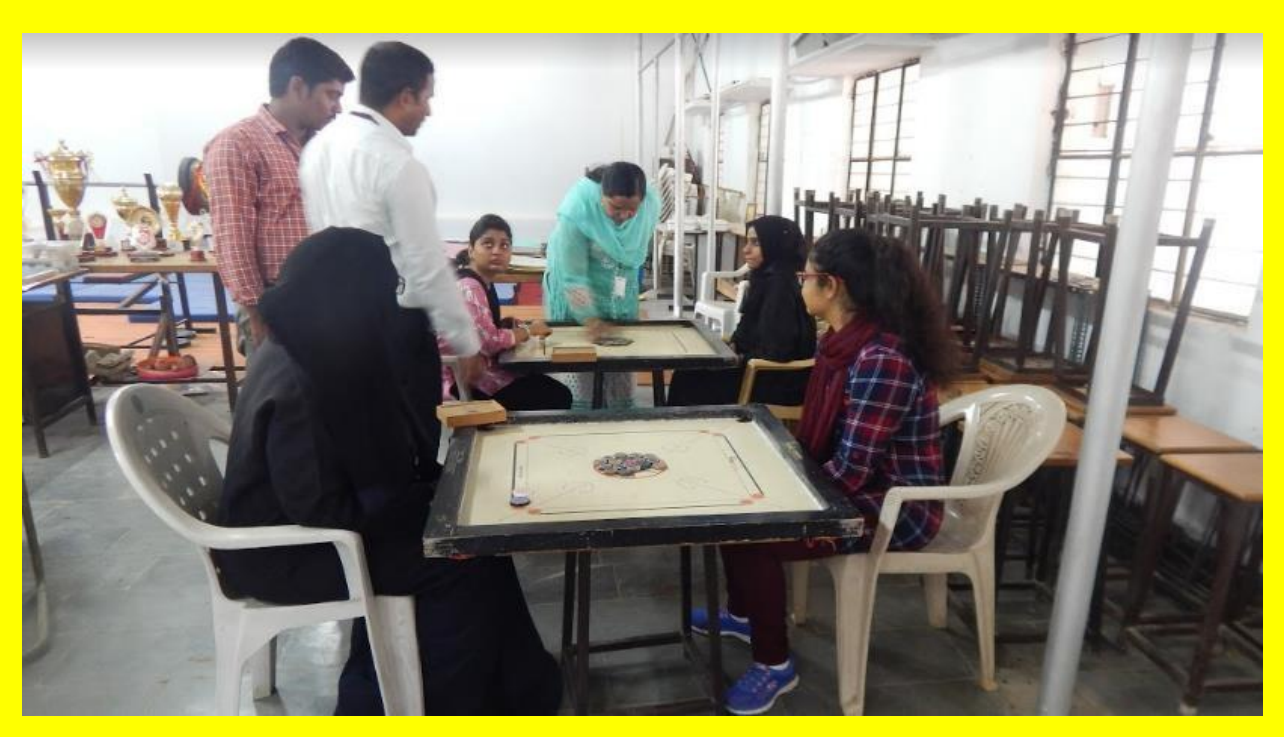
Students participating in Indoor games