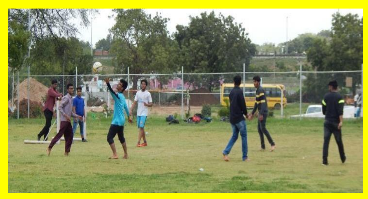
Students participating enthusiastically in Outdoor Games