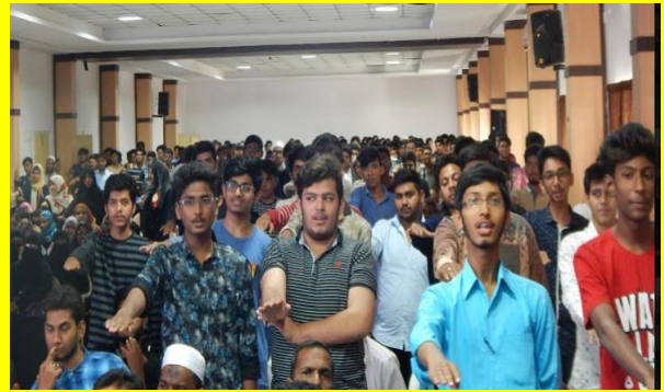
Freshers taking Oath Promising to maintain the decorum of the college

A sumptuous lunch was provided by the Management to all the freshers and their parents. It was followed by the Departmental visit by the freshers and parents to introduce them to the labs, infrastructure, the class rooms etc. The program concluded with a vigorous note.