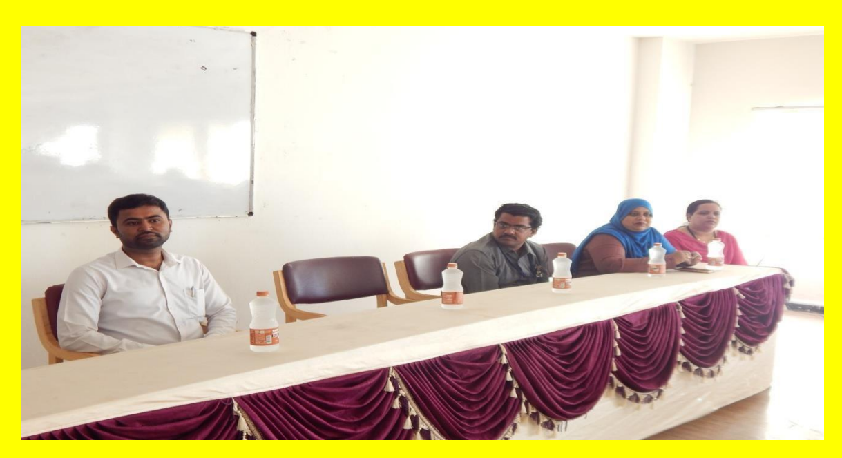
Chief Guest and Dignitaries at Guest Lecture