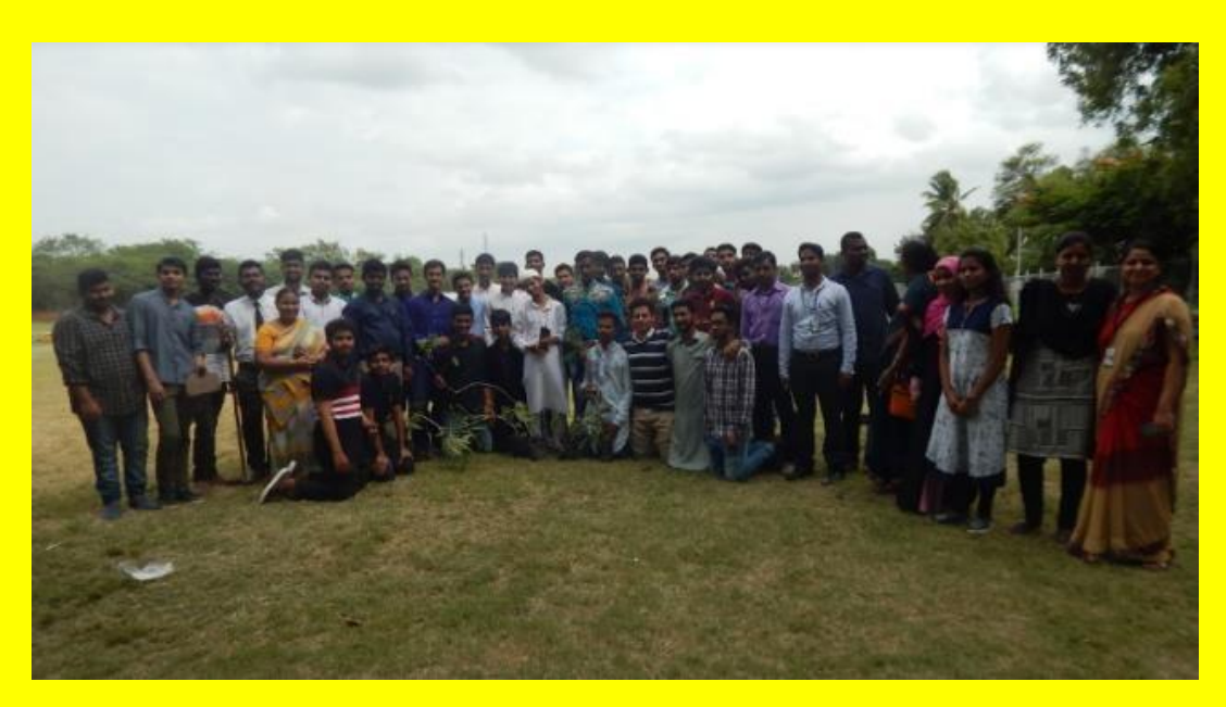
Plantation Program under NSS activity

Day-7: The students' talents were explored in the Talent Hunt Program in which the students energetically participated in various cultural activities and created an atmosphere of awe. There was a festive gusto at its zenith with the spell of music and dance all around.