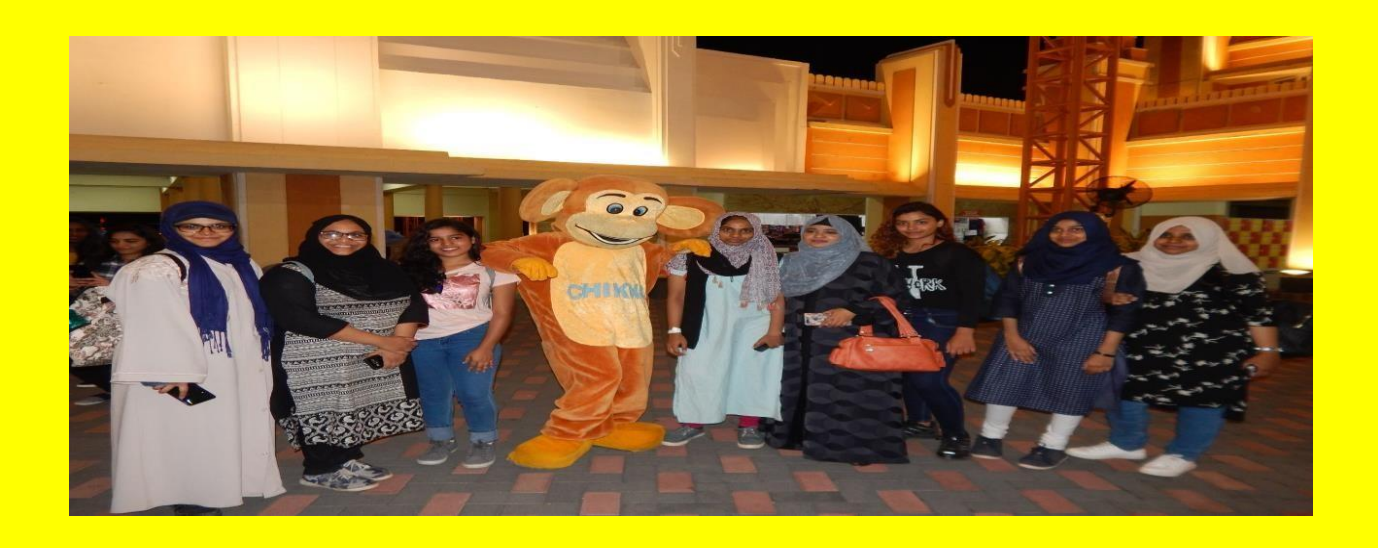
Fun time at Wonderla!