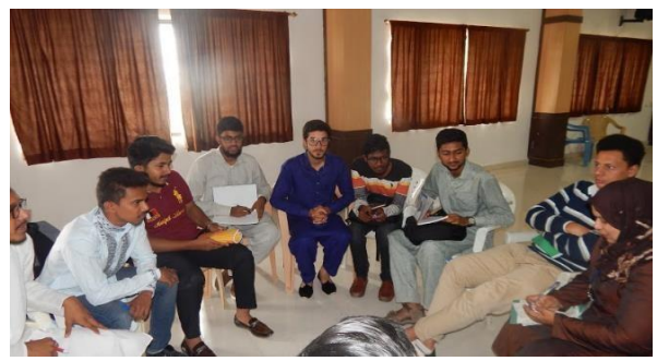
Students giving their feedback and interacting with class teacher and faculty