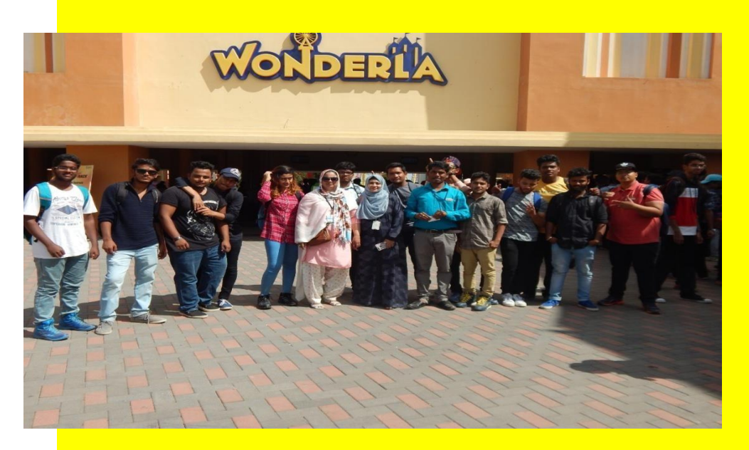
Students and Faculty at Wonderla enjoying the splashes!

The day was well spent by enjoying, singing and playing. It was a wonderful opportunity for the students to strengthen their will and their friendship bonds that would remain forever cherished and in the evening everyone came back to the college rejuvenated.