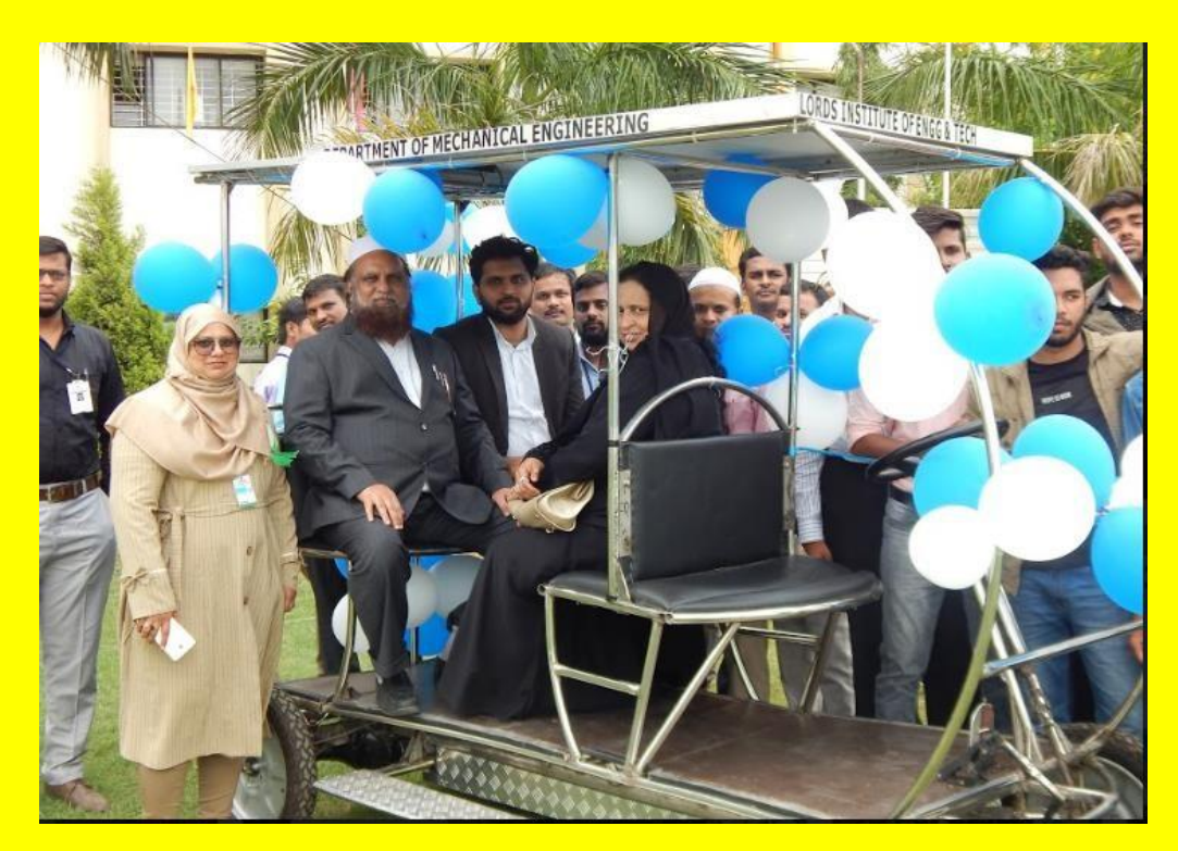
A feather in the cap of LIET – low cost battery operated car