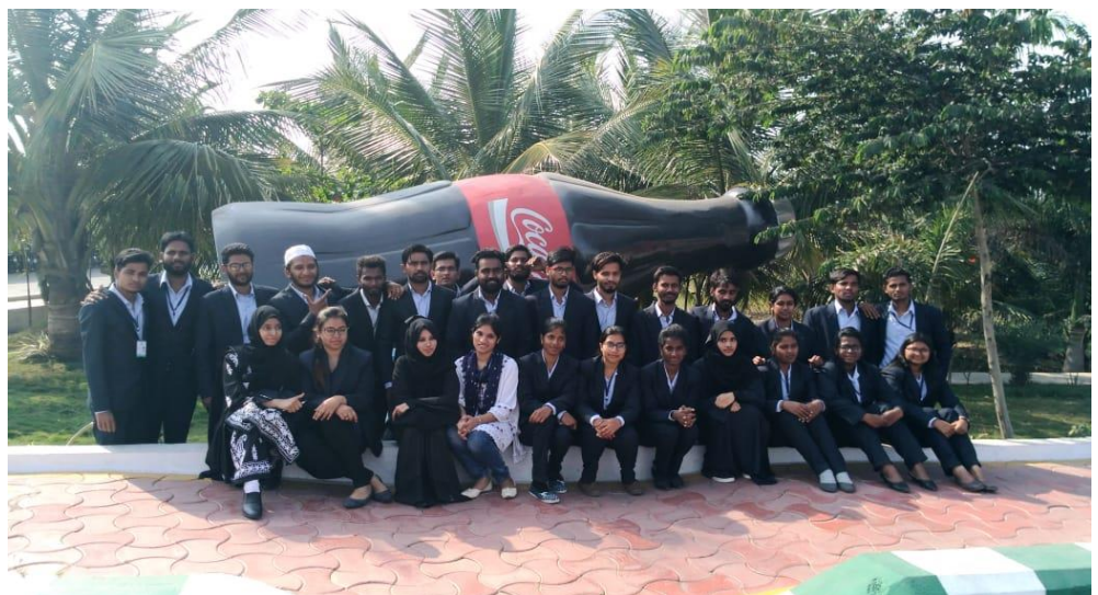
Fig: Industrial visit to Coca Cola Co Ltd.