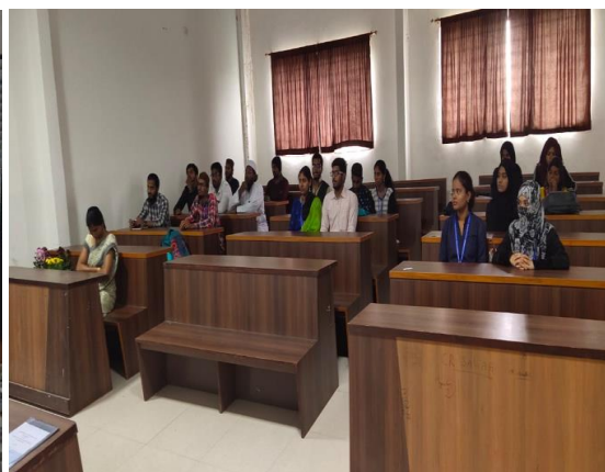
Students listening to the importance of Discipline and change management session

Before the start of the lecture the students were addressed by the respected Principal and Department HOD who shed some light upon the importance discipline.