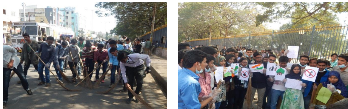
create awareness amongst the students and residents regarding the environment

Clean India Mission in English is a campaign in India that aims to clean up the streets, Roads, cities and rural areas.